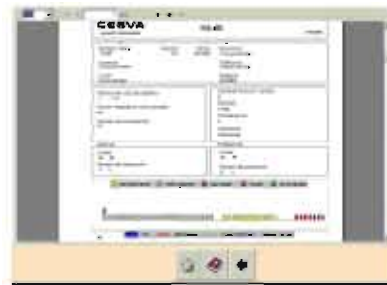
Generate a report